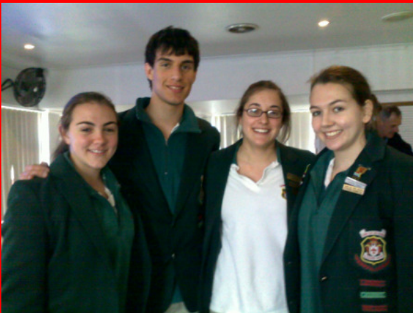
The Camps Bay Interact visit the Rotary Club of Sea Point.